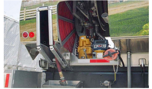
SINGLE HOSE REEL