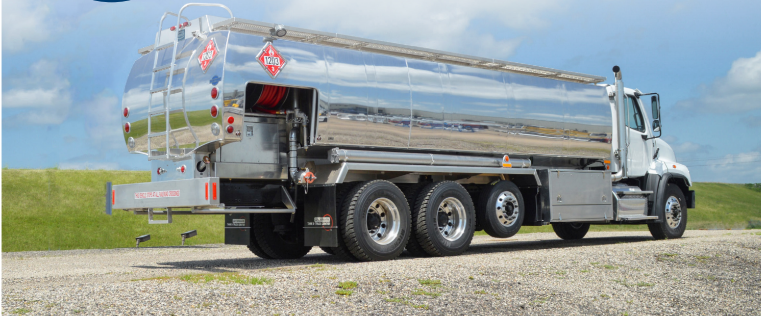
FCT REFINED FUEL TRUCK