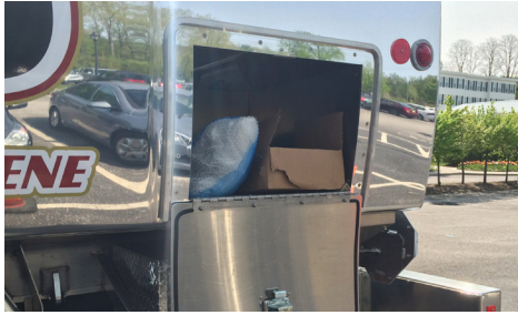
SIDE SHELL CABINET