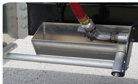
NOZZLE BOX AND ROLLERS