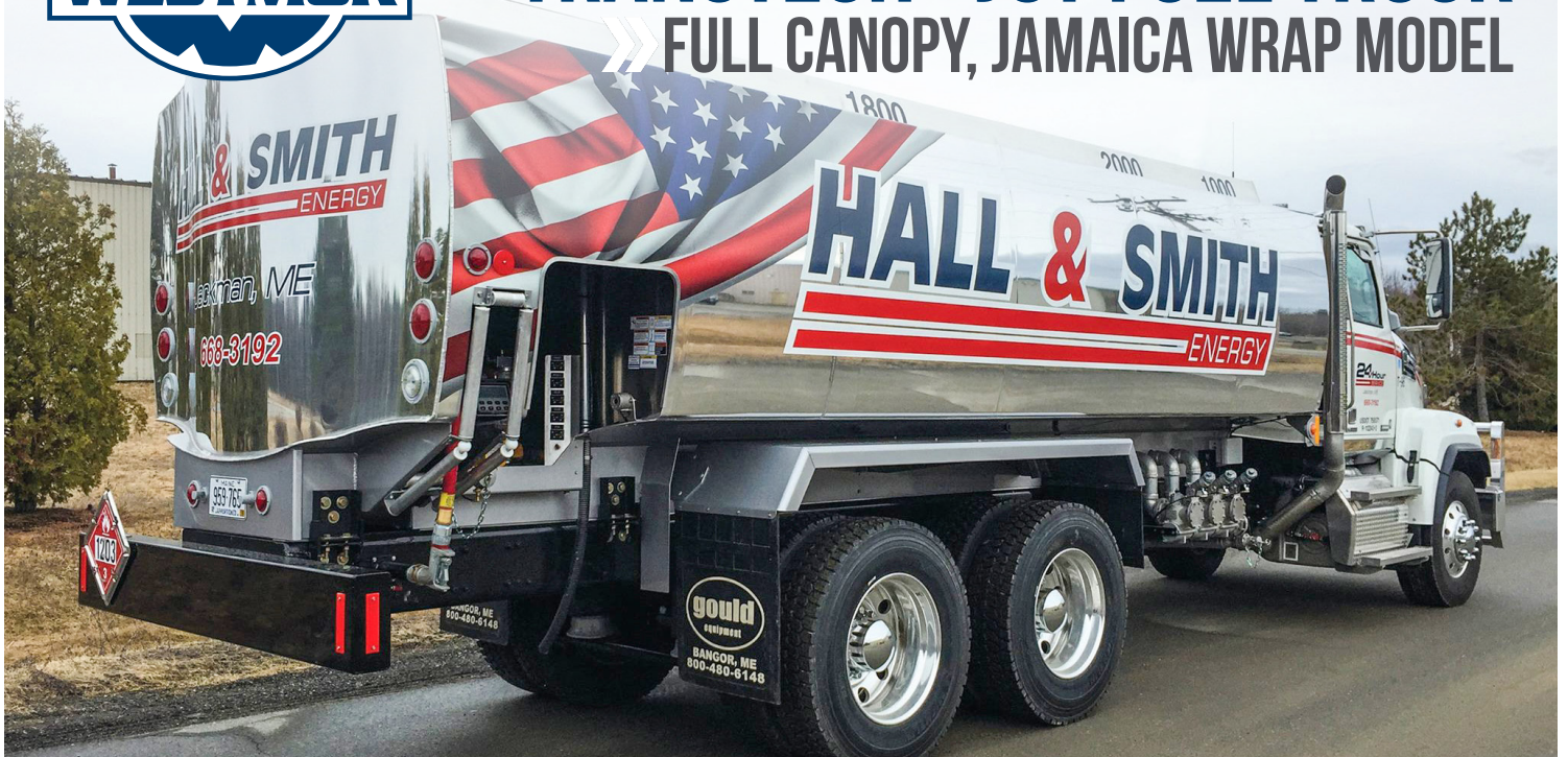
JCT REFINED FUEL TRUCK